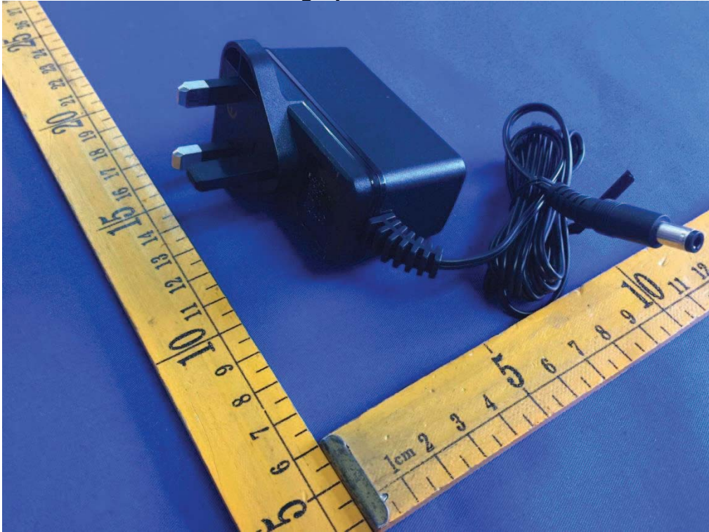
Picture 1, Overall view of AMS200-1201500FB