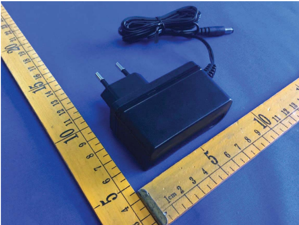
Picture 4, Overall view of AMS200-1201500FV