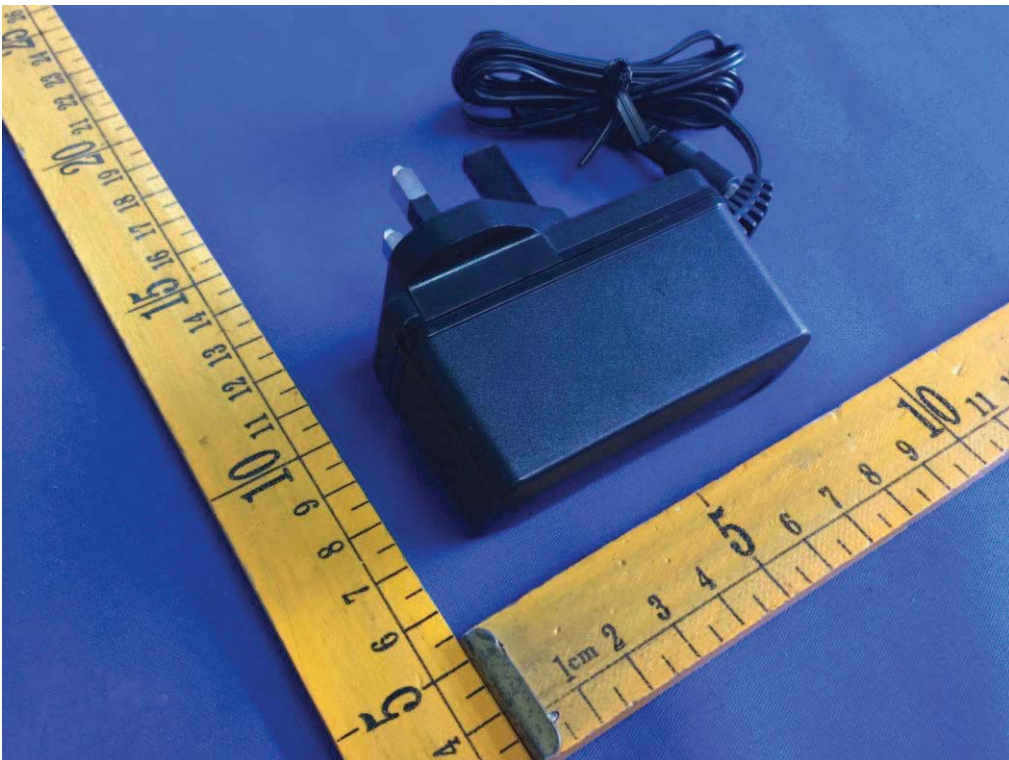
Picture 2, Overall view of AMS200-1201500FB