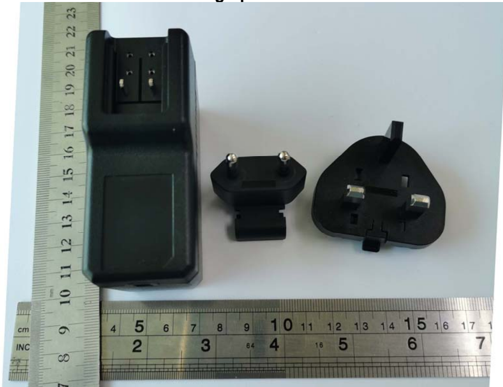
Picture 5, Overall view of AMS200-1201500F