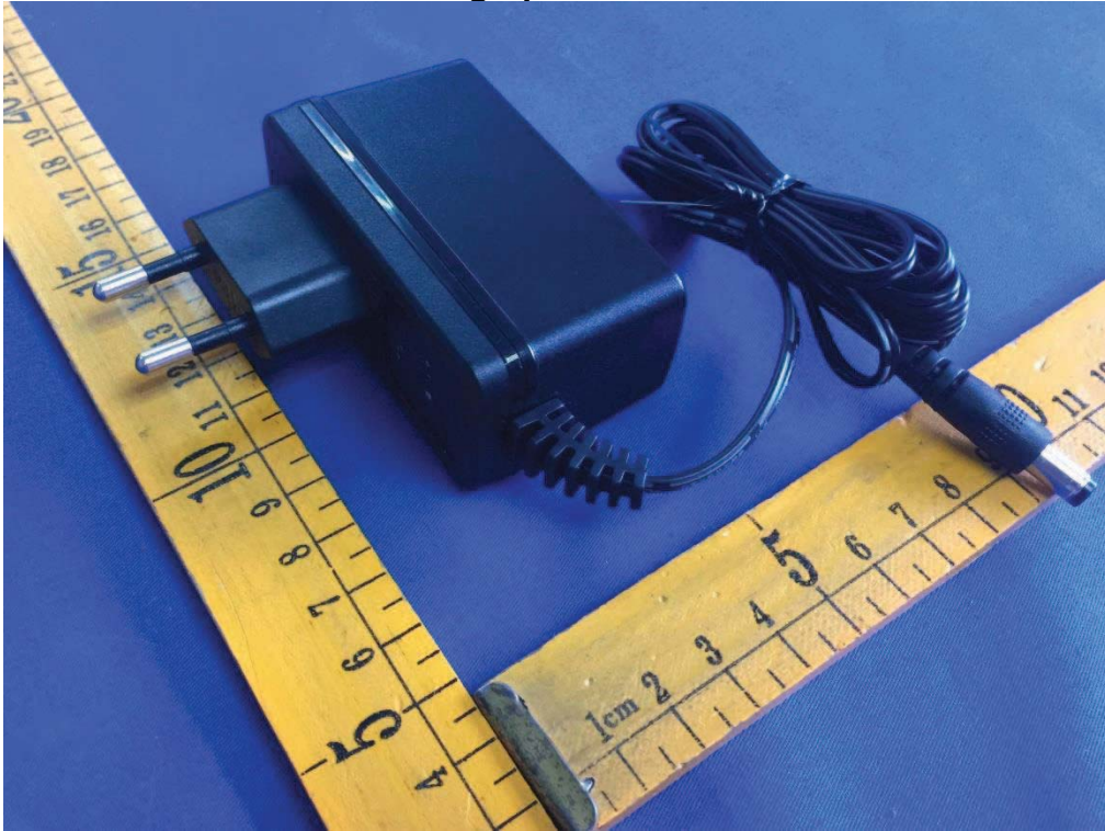
Picture 3, Overall view of AMS200-1201500FV