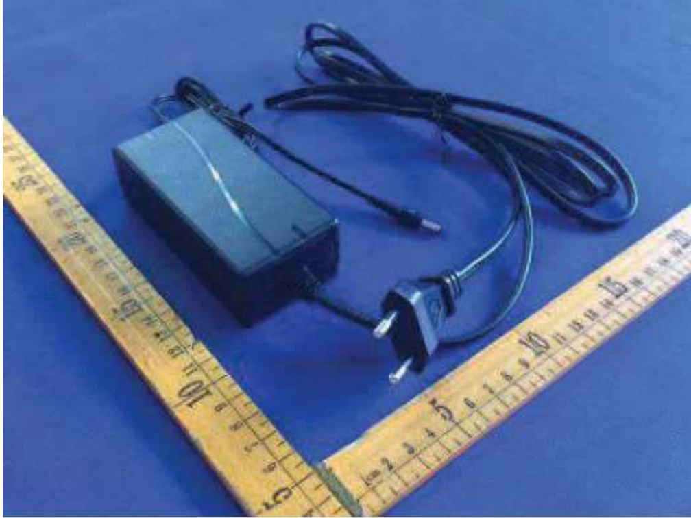
Picture 7, Overall view of AMS200-1201500F3V