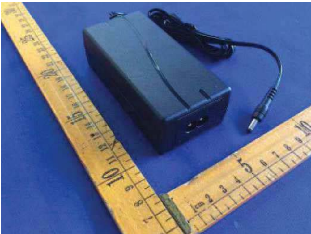
Picture 6, Overall view of AMS200-1201500F